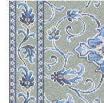
FORGET ME NOT RUNNER 92/20102