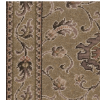
LEATHER RUNNER 52/2289