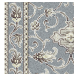
SHALE RUNNER 93/20102