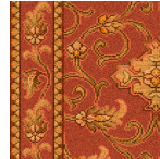
CORALLIN RUNNER 81/2289