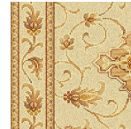
MARBLE RUNNER 42/2289