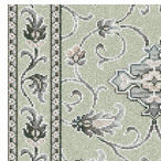
PISTACHIO RUNNER 31/20102