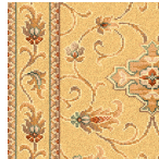
IVORY RUNNER 41/2289