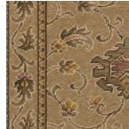
BRACKEN RUNNER 72/2289