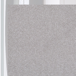
FORGET ME NOT