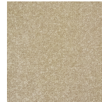
CORAL CLUSTER 893