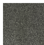
NIGHT SKY 883