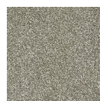
LIMED OAK 888